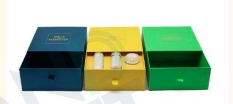
100% Sustainability Folding Drawer Boxes Magnet Free