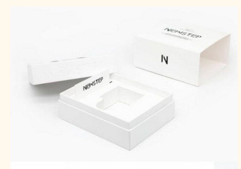
Luxury Perfume Packaging Gift Box with Sleeve Paper