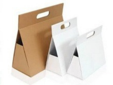
Folding Gift Bag