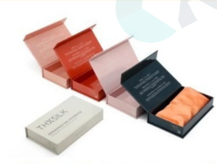
Silk Scarf Packaging Boxes with Glossy Laminated